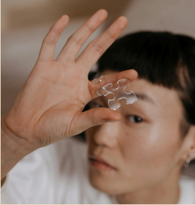
04 MARKET RESEARCH