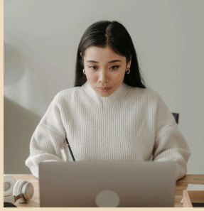
02 SOCIAL MEDIA MANAGEMENT