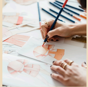
06 CREATIVE SERVICES