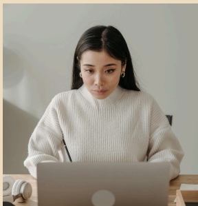
02 SOCIAL MEDIA MANAGEMENT