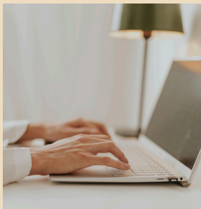
03 CUSTOMER SERVICE