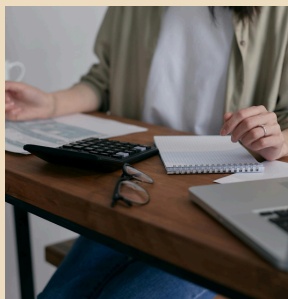
05 TALENT-ON- RETAINER