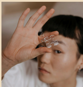
04 MARKET RESEARCH