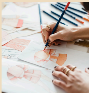
06 CREATIVE SERVICES